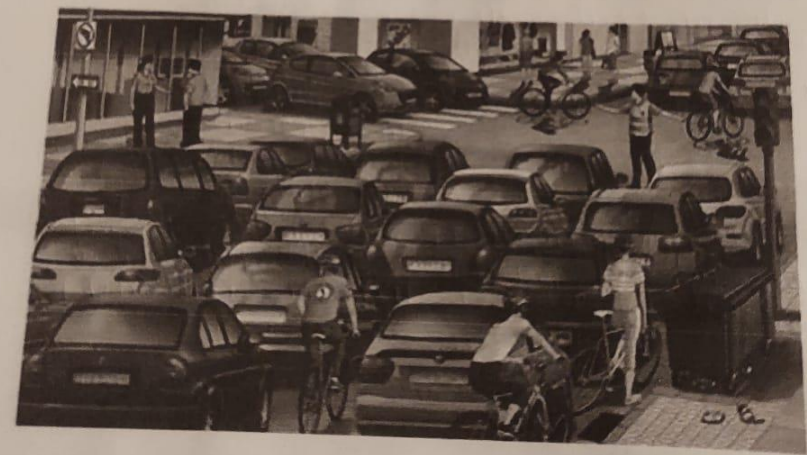
How's the neighborhood? 47