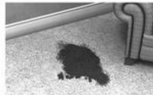
3. The carpet is stained, I drop the wine.