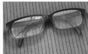
9. Your glasses are cracked, buy new ones.