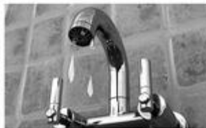
5. The sink is leaking, I need to call a plumber.