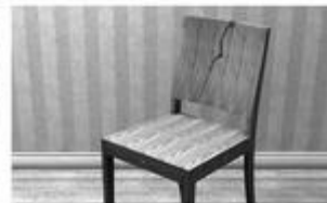
6. The chair is chipped, I have to buy a new one.