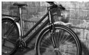
4. The bike is dented, someone outside must hit it.