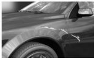
1. The car is scratched. OR There's a scratch on the car.

B What is wrong with these things? Use the words in part A to write a sentence about each one.