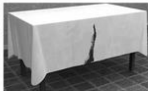
8. The tablecloths are scratched, change them.