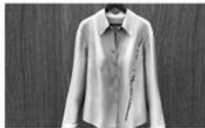
2. The blouse is torn, I see it after you take it off