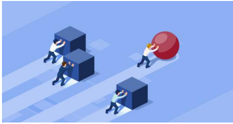
Concern for others