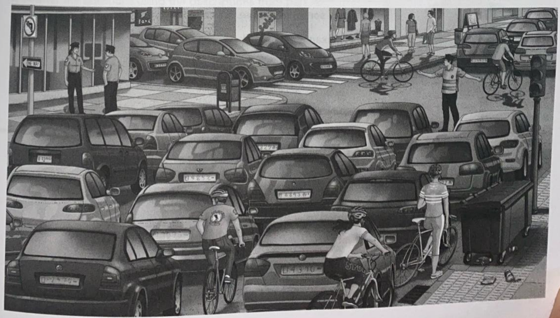
How's the neighborhood? 4