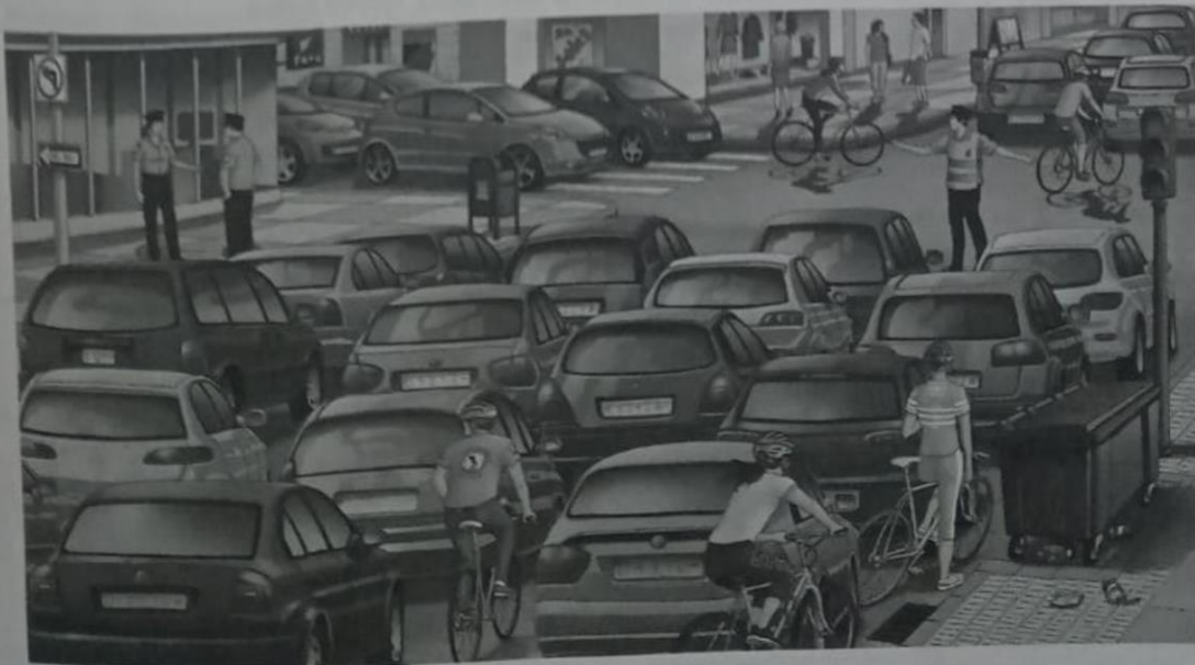
How's the neighborhood?