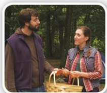
1. Beth's husband

https://www.cambridge.org/files/1415/9300/7067/Interchange_4_Level_1_Unit_5_Video.mp4