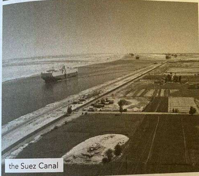
the Suez Canal