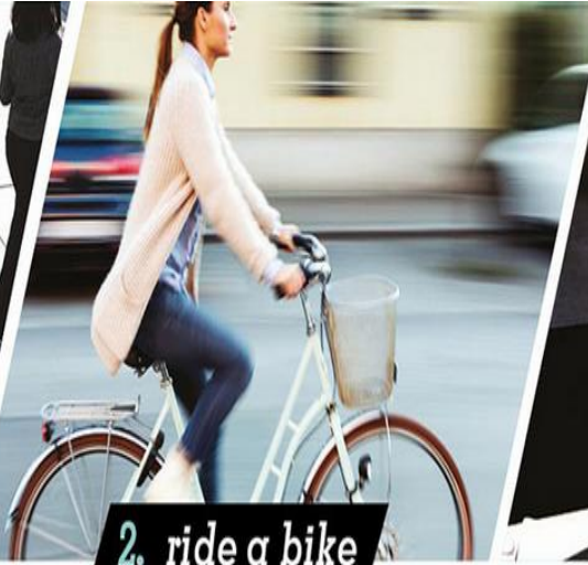
2. ride a bike