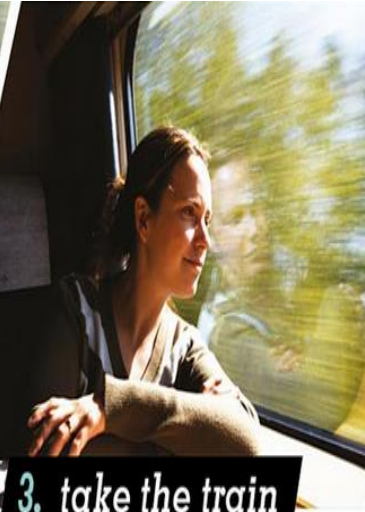
3. take the train