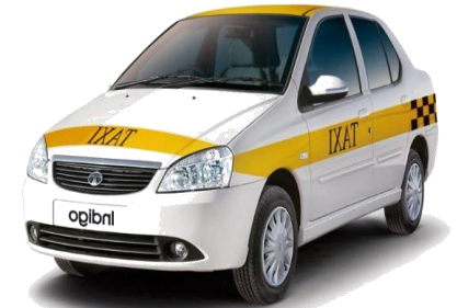
taxi / cab