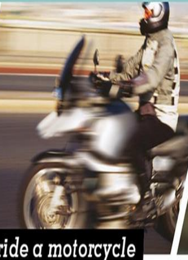
7. ride a motorcycle