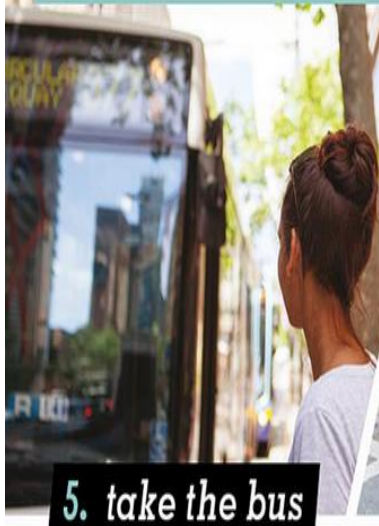
5. take the bus