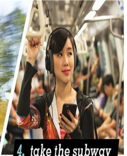
4. take the subway