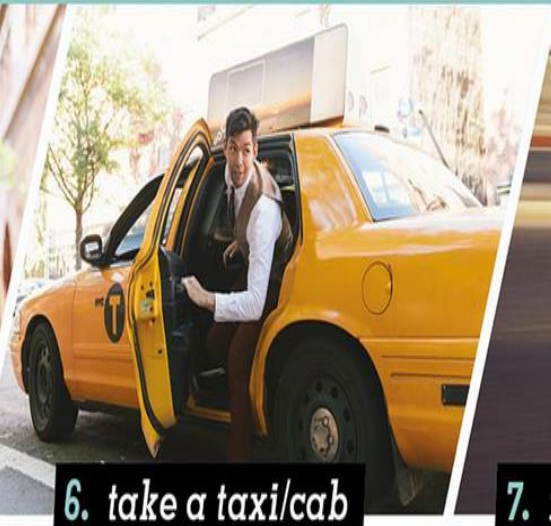
6. take a taxi/cab