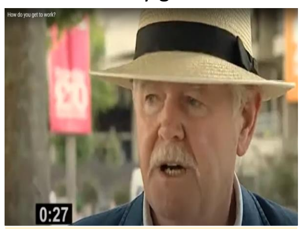
He drive a car to his work