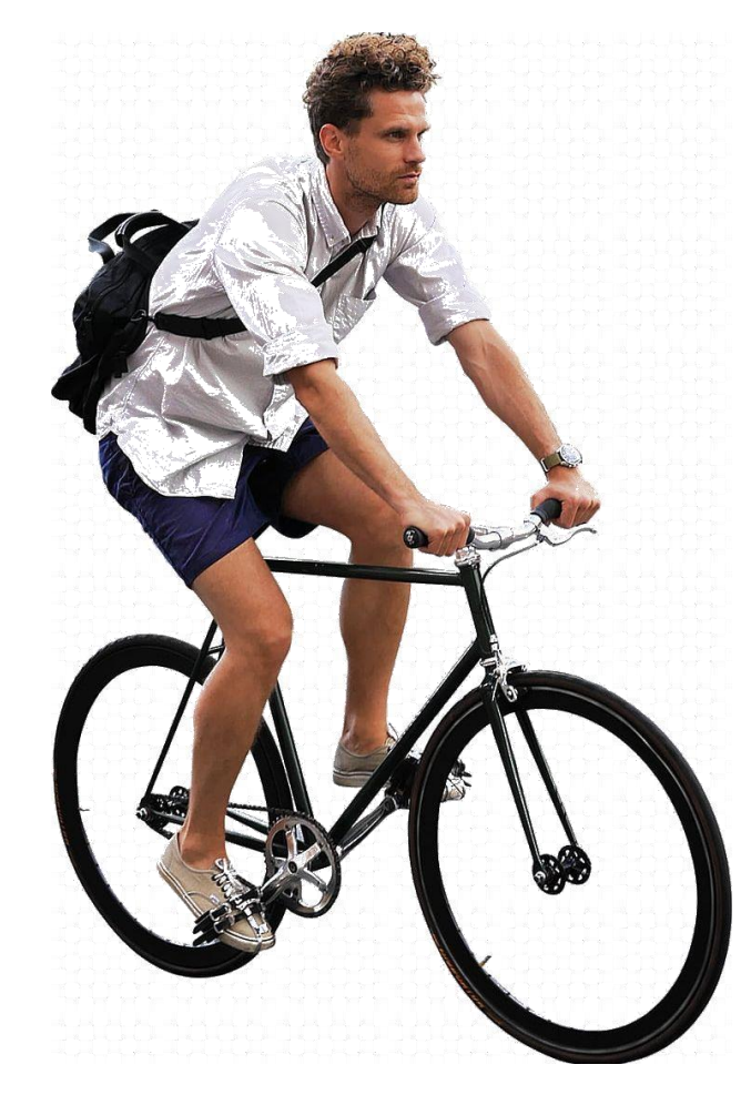
I ride a bike to school

In English, we use the verbs drive , ride , take ( or go ) to talk about travel and transport. Although they all express travel and movement, they are used in different contexts to refer to different modes of transportation.