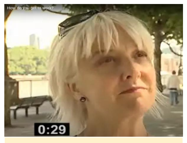
She travel in bus to her work