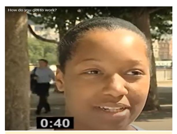
She walk to station and take the bus to her work