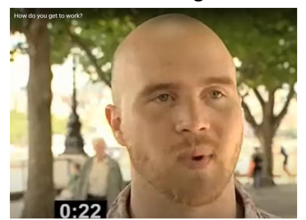
He travel in bus and walk to his work

Whatch the video again and answer how do they get to work.