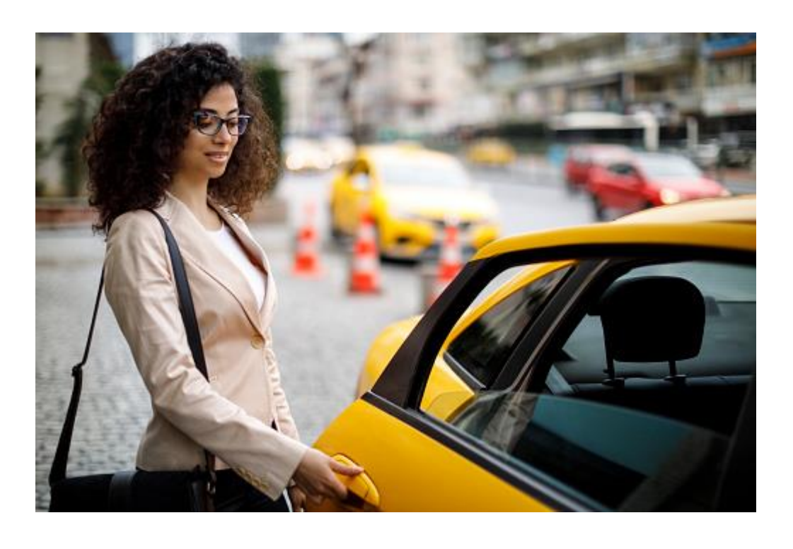
I take a taxi/cab to work

In English, we use the verbs drive , ride , take ( or go ) to talk about travel and transport. Although they all express travel and movement, they are used in different contexts to refer to different modes of transportation.