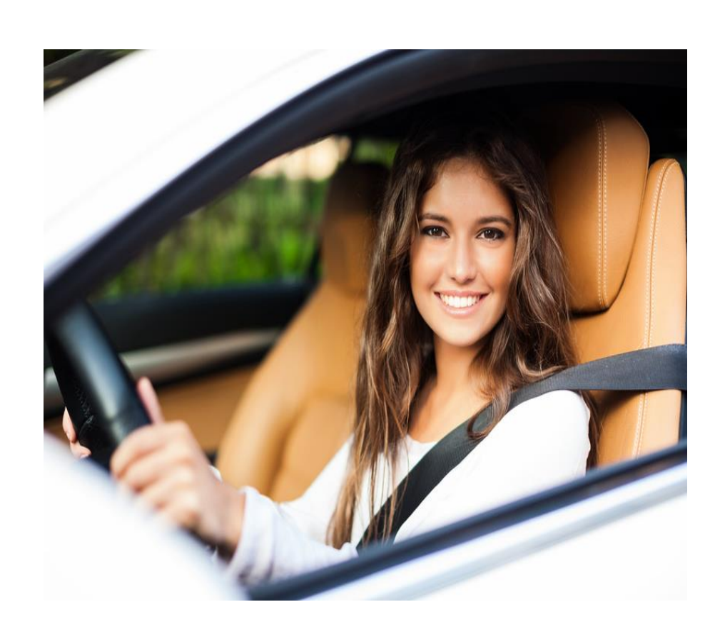
I drive to school

In English, we use the verbs drive , ride , take ( or go ) to talk about travel and transport. Although they all express travel and movement, they are used in different contexts to refer to different modes of transportation.