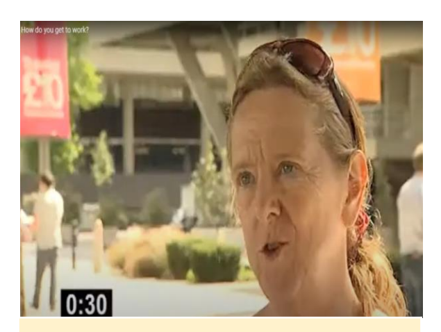
She walk to her work