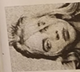
Billie Eilish U.S. 17