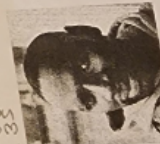
Omar Sy France 45