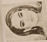
Adele Adkins England 38